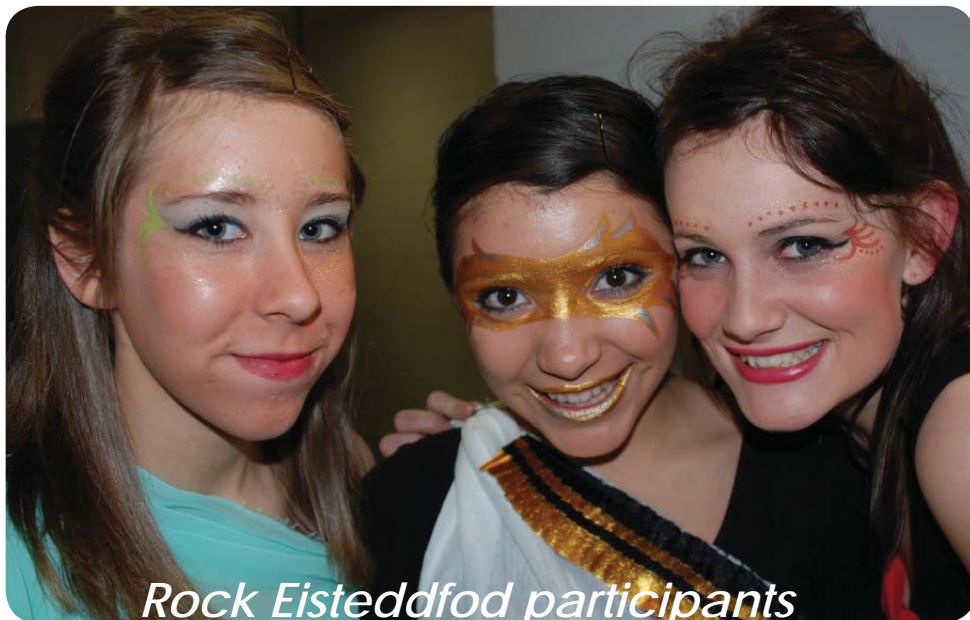
Rock Eisteddfod participants