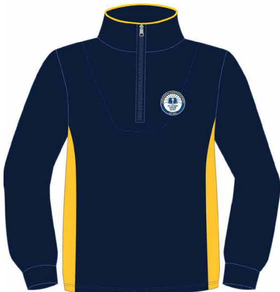
1/4 Zip Sports Jumper ELC - Year 6